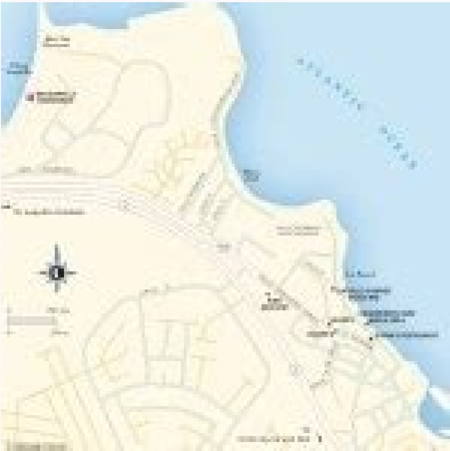
San juan puerto rico tarpon fishing guides.